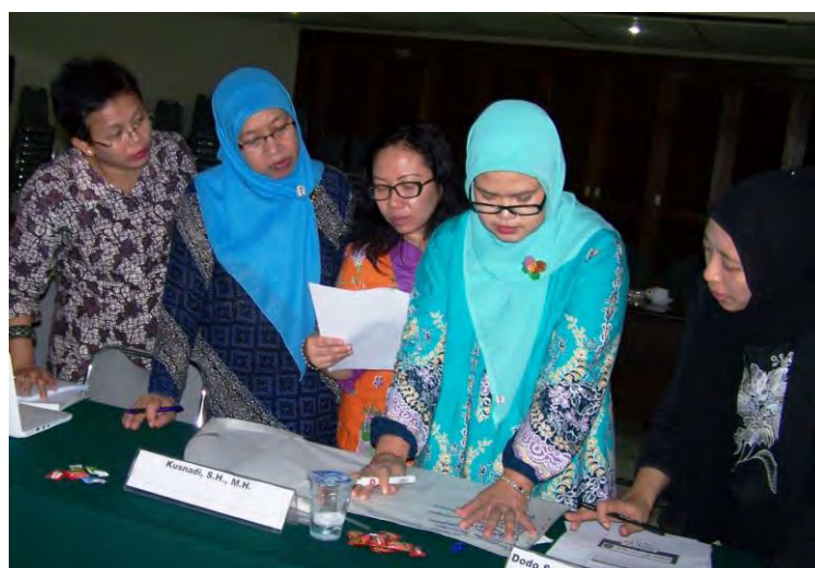
CHRP students in a discussion on “Human Resources Function and Management in the Supreme Court” and how roles and responsibilities are implemented.

The CHRP program addressed technical issues of change management, organizational development, performance management, job analysis, roles of leaders, human resources audits, competency-based human resources management, strategic human resources planning, workforce planning, recruitment and selection, learning and development, knowledge management, career planning, career development, talent management, job evaluation, and applying merit principles for public service. Of the 30 participants, 28 successfully completed the 11-week program, 5 with three students being recognized for outstanding performance.