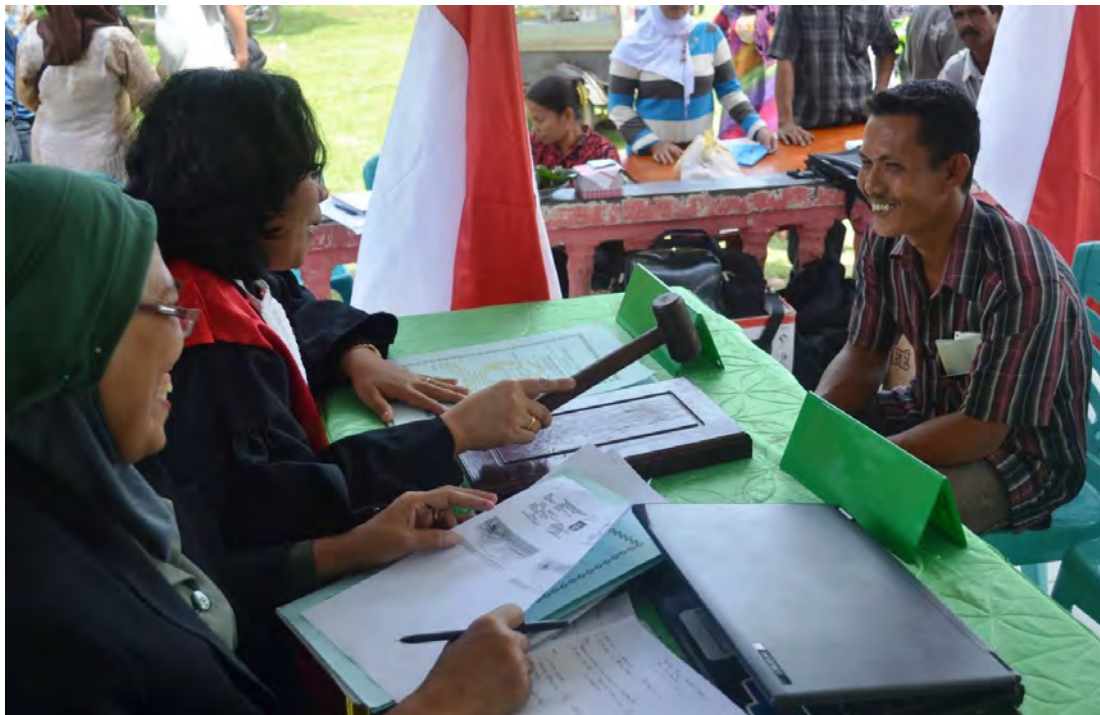
Stabat District Court (North Sumatra) has been a leader in providing mobile court services to surrounding villages and towns. This photo won USAID/Indonesia's 2013 photo contest.

Following the implementation of the new PERMA, the project examined how the CTS may capture additional, key data on legal aid services in the first-instance courts, namely fee waivers and hearings outside the courts. These data should be prioritized in future enhancements to the CTS, as recommended in the CTS Roadmap.