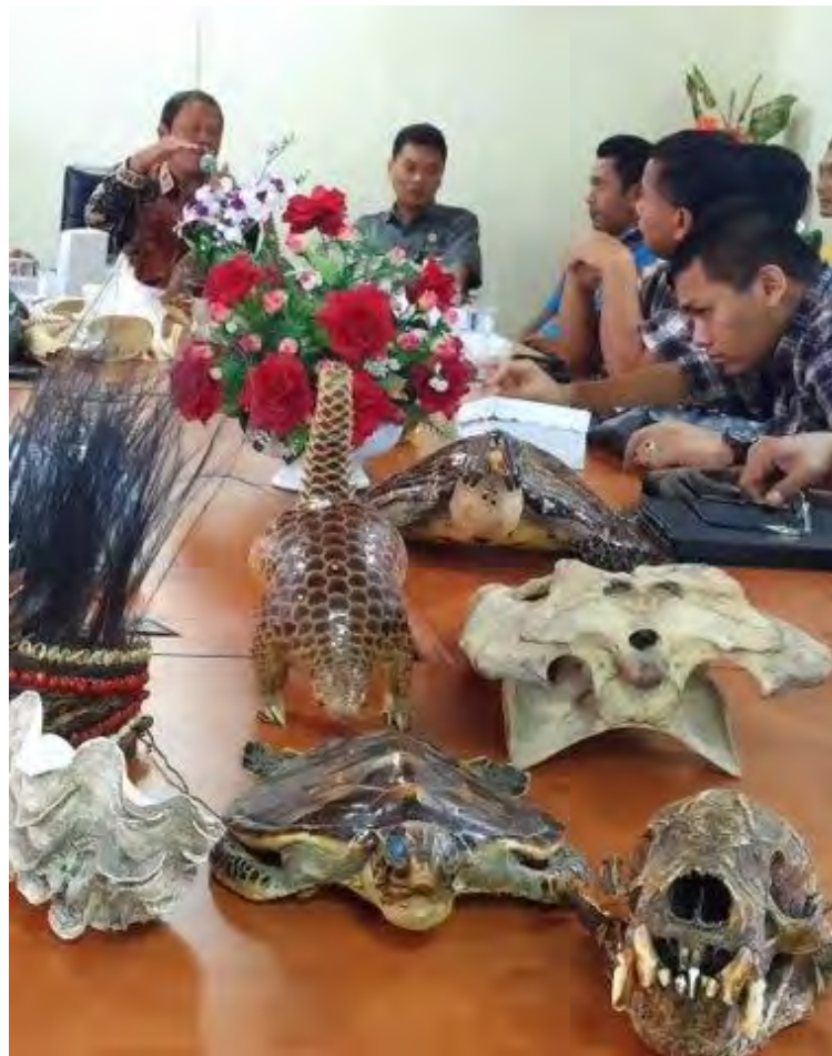
Participants in Biodiversity Case Handling had an opportunity to discuss challenges in law enforcement aimed at protecting biodiversity with the head of the Bali Natural Resources Conservancy Agency.

One of the constraints in the first workshop was that only judges and prosecutors participated. To effectively handle such cases, judges and prosecutors need the results of investigations made by the police and civil investigators as the spearhead of case handling.