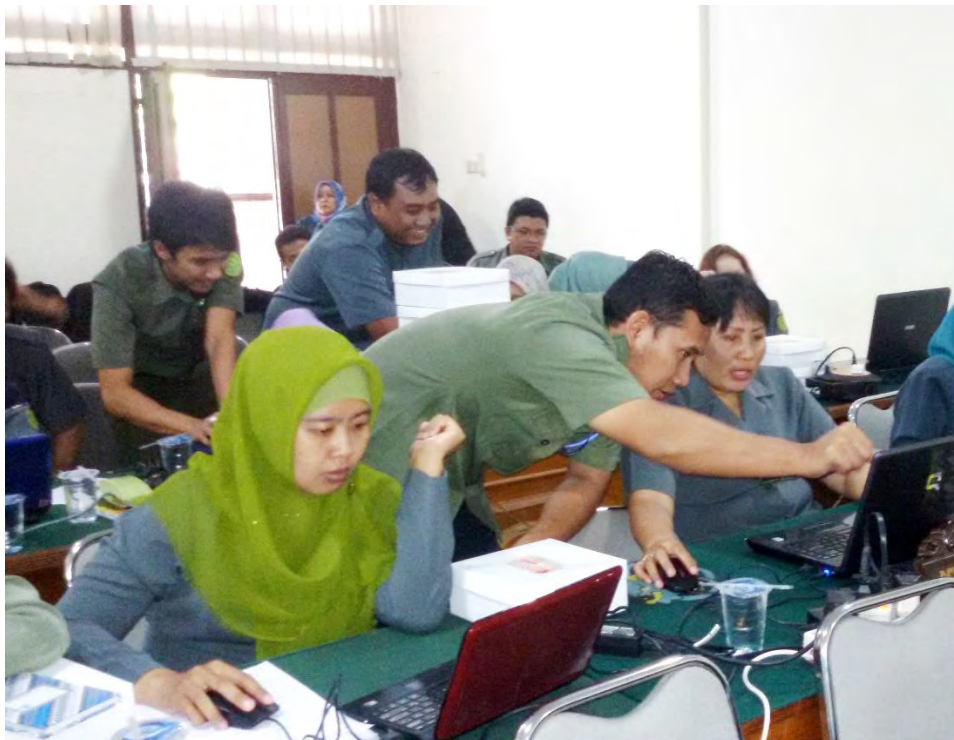
Members of the CTS Development Team provide assistance to staff at the Yogyakarta District Court as they pilot new juvenile case functions in a revised Version 3 of the CTS. The court staff also tested new templates to be launched in the revised Version 3.

The modifications to the juvenile case functions were tested in the Yogyakarta District Court and Bekasi District Court prior to obtaining approval from the Directorate General for the General Courts and the Supreme Court Case Management Working Group. A Supreme Court decree officially adopting the new juvenile functions, and launching it in a revised Version 3, was not issued by the end of the C4J Project. The EU-funded SUSTAIN Project, implemented by UNDP, has accepted the task of trying to help get the decree issued.