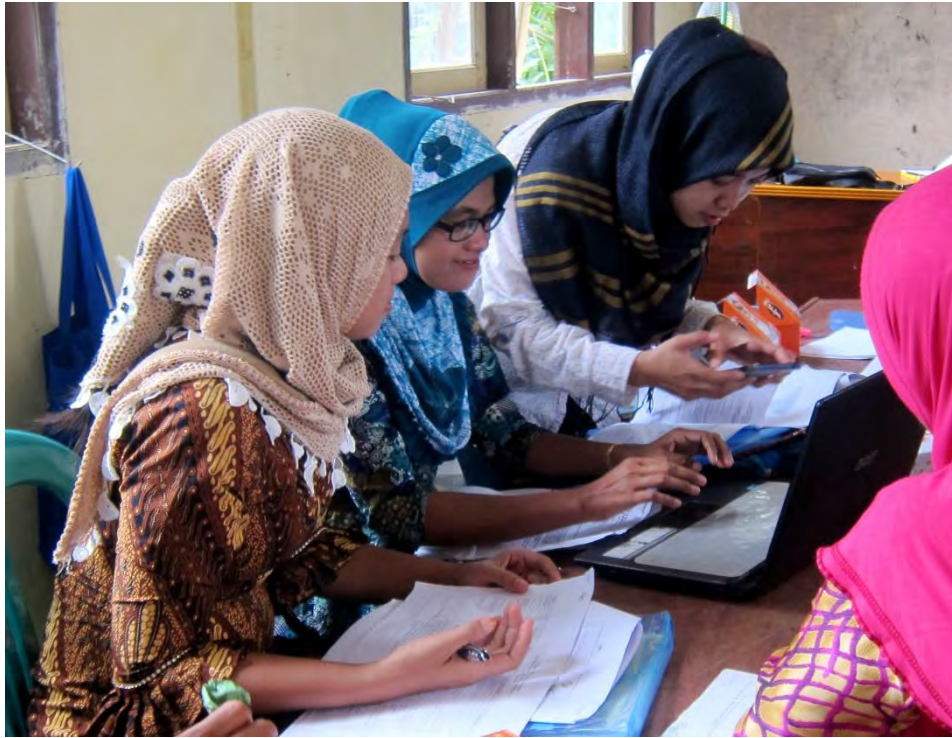
A group of women writes a story about accessing information on government programs in their village. The C4J Project's citizen journalism training shown above was held in a community in Kampar Kiri sub district, Riau, on February 21, 2015. The training allowed participants to practice writing news articles, opinion pieces, and photo-based stories.