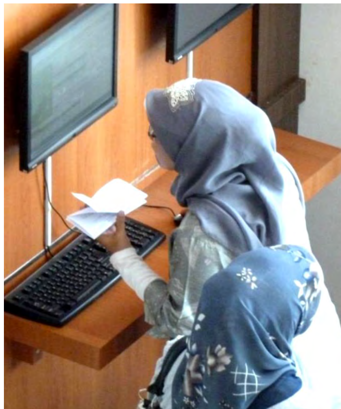
A law student looks for information at an Internet kiosk in East Jakarta District Court. Through CTS, the public can access information through the court website. This information can also be accessed via the Internet kiosk located at the district court’s main entrance.

In conjunction with development of the court website guidelines, the project drafted new Integrated Court Services Guidelines, grouped into three main themes: Access to the court building, access to information, and management of complaints. The Guidelines document lessons learned and best practices from courts throughout the country.