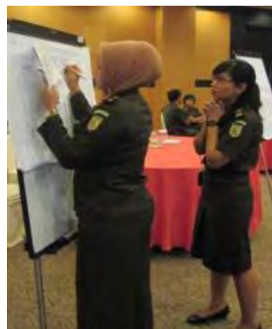
Public information service workshops underway at the Ambon District Prosecutor's Office (left) and the Denpasar District Prosecutor's Office.