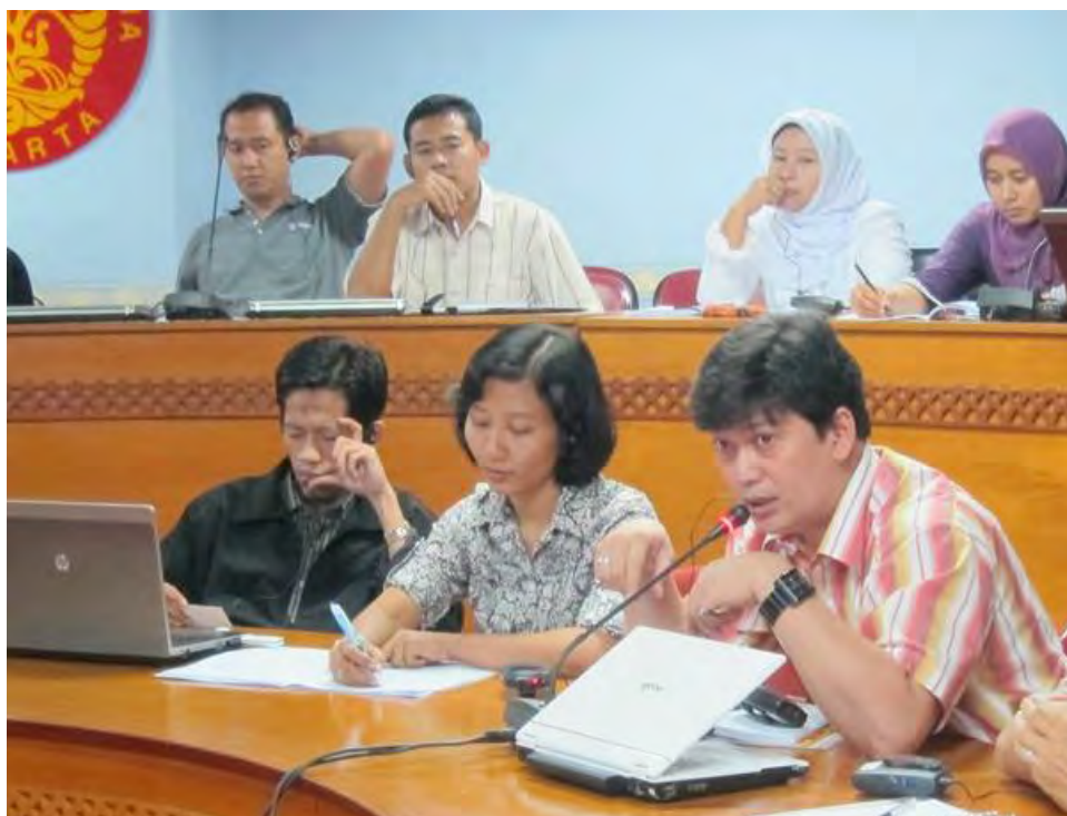
Students of the Fellowship Program in Judicial Practice join in a discussion with a guest lecturer on judicial court decision making.

The curriculum for the program was tailor-made for completion within 18 months or three semesters. The curriculum was specifically designed to meet the judges' practical needs and included courses in philosophy of law, politics of law, legal research methodology, bankruptcy and insolvency, criminal law and economic activities, environmental law, tax law, intellectual property rights, and legal ethics and professional responsibility.