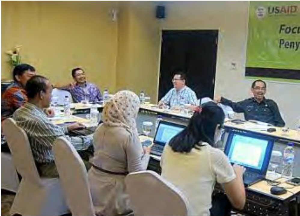
The AGO's representatives discuss technical competencies with C4J and subcontractor Langkah Mitra Selaras (LMS), who assisted with development of the competencies. The final competency document was submitted to the AGO.

Development of the competencies is a significant achievement for the AGO. It was a five year process. In the end, the project worked with four different subcontractors to achieve a vision and approach that was appropriate and acceptable for the institution. The final set of competencies spans positions at the levels of echelons I, II, and III, and heads of PPOs and DPOs.