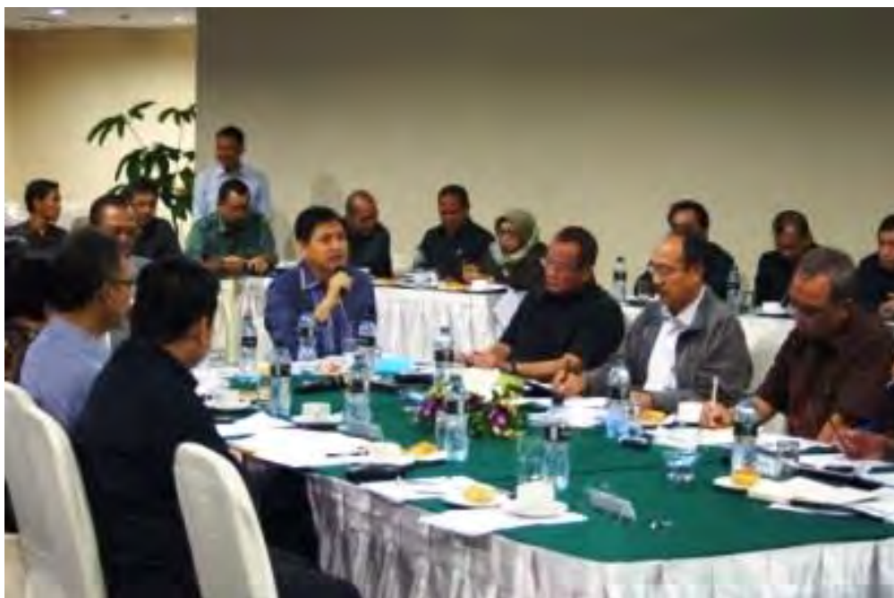
Participants, including from the Supreme Court Secretariat, National Development Planning Agency, Commission III of the Parliament House of Representatives, Ministry of Finance, C4J, and PPPI during the second discussion session on judiciary budget independence.

The results of the study were presented at a joint meeting in February 2014. Attendees included the Secretary and Echelon I leaders of the Supreme Court, the Deputy II Director of Budget at the Ministry of Finance, a member of Commission III of the Parliament, and the Director of Legal and Human Rights at the National Development Planning Agency ( Bappenas ). The study and subsequent discussions revealed that three factors impact budget independence of the judiciary in Indonesia: legislative policy, budget policy, and the internal capacities of the judiciary. The dimensions of improvements needed for reforming the internal capacities of the judiciary are substantial. The necessary solutions are fully within the authority of the Supreme Court. Thus, internal capacity reforms to achieve judicial budget independence should be the priority.