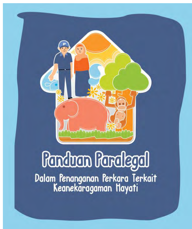
Cover of the C4J-supported Community Handbook.

The development of public information campaign products had its challenges because the C4J Project intended to develop simple, representative, and engaging images to convey messages about public services at the courts and prosecutors' offices. The Supreme Court and the AGO have taken active ownership of the process, including brainstorming about concepts and defining appropriate images and key messages. These public information materials must continue to be sustained through complementary community engagement and outreach activities by the courts and prosecutors' offices.