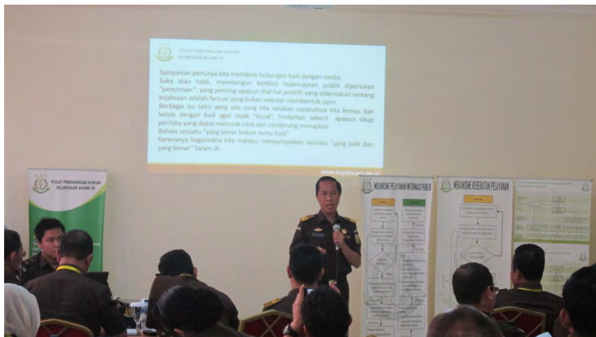
The head of the Legal Information Center addresses the class during opening day of the training. The SMS from the Attorney General for all participants is translated on the following page.

Near the end of the project, the AGO's head of the Puspenkum expressed the need for PPID training for PPOs across Indonesia. This training was deemed necessary to improve public information services in all PPOs and DPOs under their jurisdiction. Therefore, the project agreed to support a final TOT program on April 21-22. C4J delivered the PPID TOT program at the AGO Training Agency for 31 PPO leaders and nine headquarters leaders, in addition to leaders from Puspenkum and the Training Agency. In his opening speech, the head of Puspenkum emphasized the importance of providing information services to the public. He also presented an SMS message direct from the Attorney General reminding them of the importance of maintaining the public's trust in the prosecutors' offices.