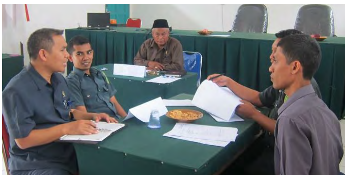
The judge and Humas staff of Blangkejeren District Court practice providing information requested by the public during an in-house training facilitated by the C4J Project.

In April 2014, the project facilitated a TOT program on Public Information Services for Documentation and Information Management Officers (PPID). The TOT was joined by 15 prospective trainers from the Supreme Court Training Agency and Humas . The Central Information Commission ( Komisi Informasi Publik – KIP ), as the adjudicator of public information complaints, was invited to facilitate a session on management of “public information disputes”.