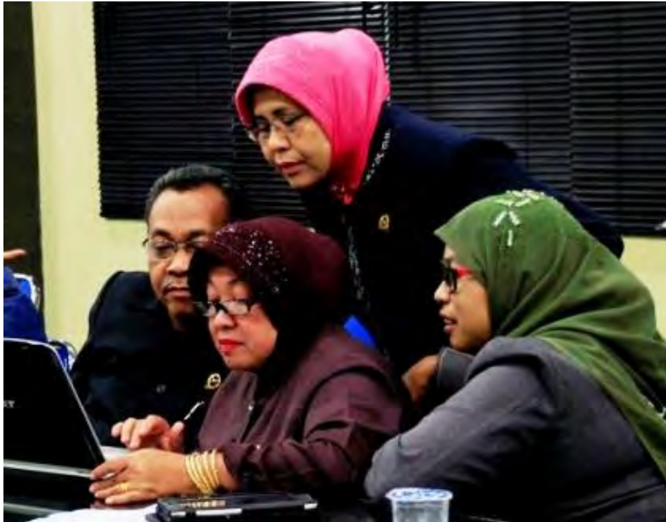
Judges from Banda Aceh High Court are shown participating in the Code of Conduct Training using ELMARI. ELMARI enables judges and court staff to complete the training anywhere, anytime, to improve productivity, learn according to their needs, and more effectively perform their jobs.

All programs – except judicial ethics, biodiversity, and case management – are limited to invited participants. All in-class training programs are using ELMARI to distribute training materials and pre- and post-tests, and to conduct training evaluations.