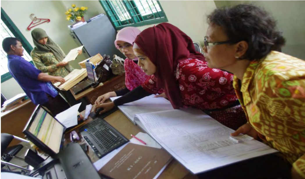
Court staff input case data from the Registry Book to the CTS during a C4J-facilitated training. Each version of the CTS included streamlining manual processes.

On March 24, 2015, the Directorate General for the General Courts issued Circular Letter No. 353/DJU/SK/HMO2.3/3/2015 on procedures for use and supervision of the CTS in high and district courts. This circular letter serves as the standard procedure for implementation of the CTS by all general first-instance courts and for supervision of CTS performance by the high courts.