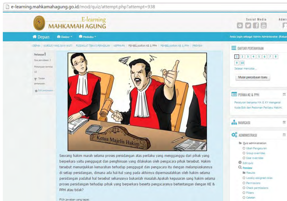
A sample of questions and illustrations on judicial ethics in ELMARI.

Initially, judges taking the ethics course were required to recommend a new hypothetical question, before printing their certificate, to assist the Training Agency in revising the course. However, the Training Agency subsequently decided to drop this requirement in lieu of development of new questions by a special committee.