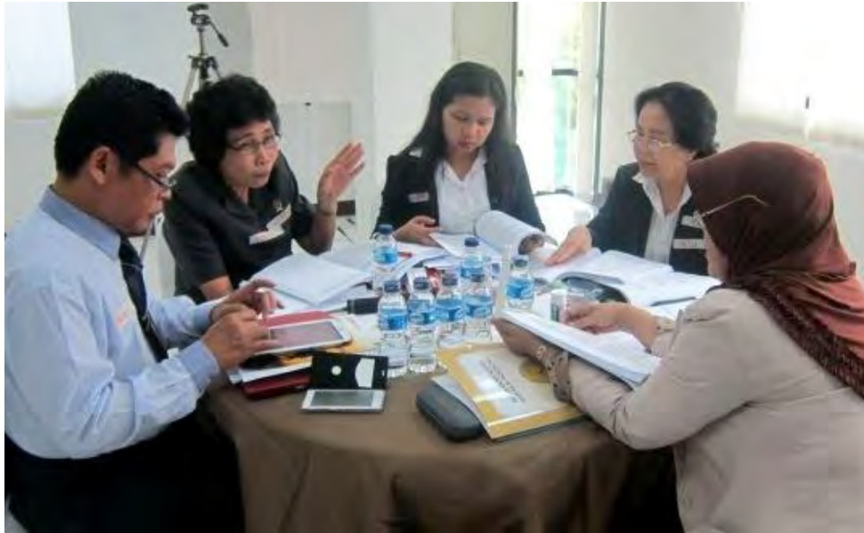
Trainers for Juvenile Judge Certification discuss training evaluation during a TOT session. Evaluation results are expected to improve training quality in the